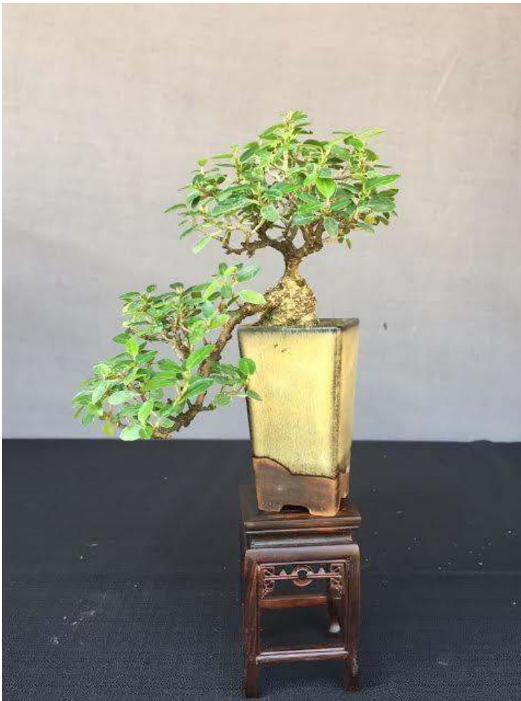
Cascade burtt davyi ficus – Hennie Reynekie (won sliver for the less than 300mm range at the October 2016 BRAT day)

PROPAGATION: CUTTINGS CAN BE PLANTED AT ANY TIME OF THE YEAR. AIR-LAYERING WILL WORK BEST IN SPRING. GROWING FICUS PLANTS FROM SEED CAN BE DONE IN SPRING.