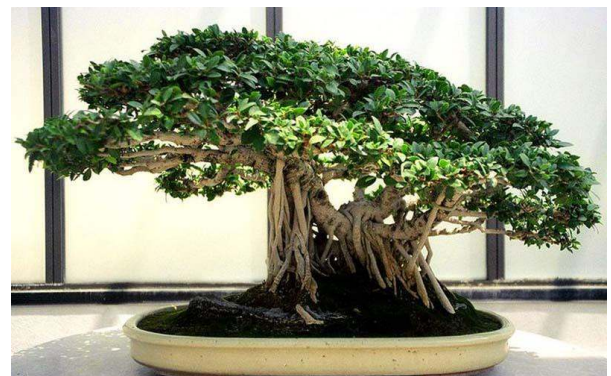
Fig with developed aerial roots – artist unknown